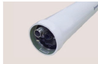
RO Pressure Vessels