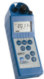
Lab Equipment and Supplies