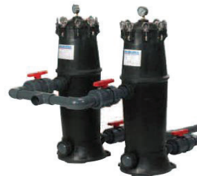
Filter Housings, Cartridges & Bags