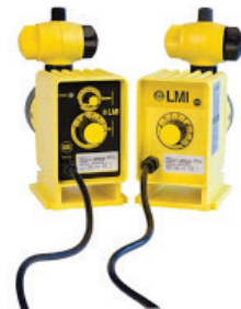
Chemical Dosing Pumps