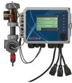
Boiler & Tower Controllers and Instrumentation