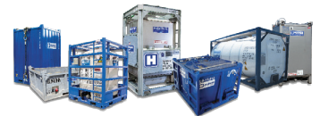
Chemical Storage and Containment