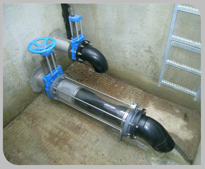
Figure 1: Typical Installation, HYDROVEX® TTT