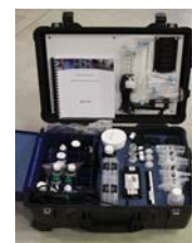
Lab Equipment and Supplies