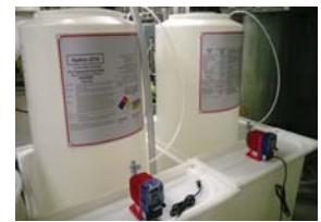
Chemical Storage and Containment