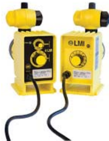
Chemical Dosing Pumps