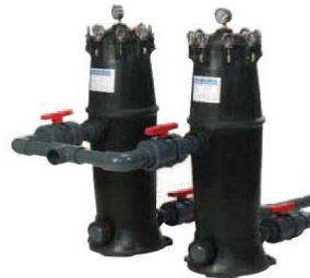
Filter Housings, Cartridges & Bags