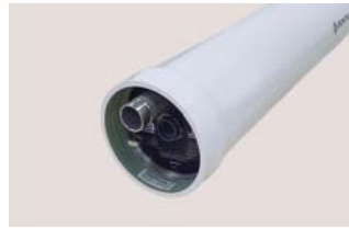
RO Housings & Pressure Vessels