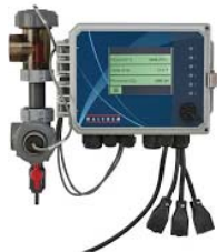
Boiler & Tower Controllers and Instrumentation