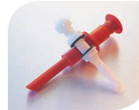
We also offer a complete line of flow nozzles for L'eau Claire and Maxi-Flo Systems.

A low-cost alternative to exotic metals. These leaves are ideal for caustic chlorine, brine and corn syrup processes.